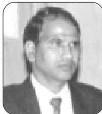
Sri N. Kishan Reddy